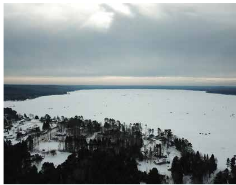
View of Lake Metonga ice fishing, late January 2018.