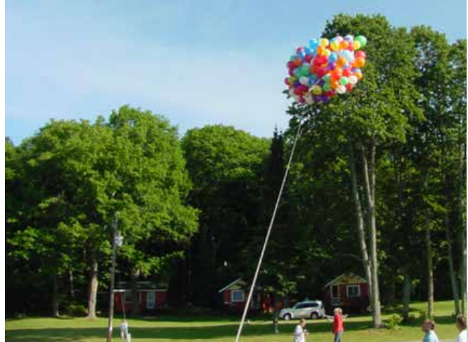
My first "drone" was simply a 35mm camera strapped to helium balloons in order to take this image over Lake Lucerne

It has a very sophisticated collision avoidance system that uses 5 cameras, dual-band satellite positioning (GPS and GLONASS), 2 ultrasonic range finders, redundant sensors and a group of 24 powerful, specialized onboard computing cores. And just in case if things go bad, it has a handy "Return to Home" function.