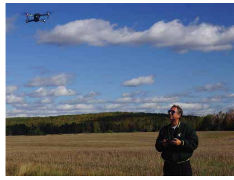
My new remote control drone.