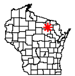
Project Location in Wisconsin

Map Date: June 4, 2014 Filename: Met_EWM_T2014Perm1.mxd