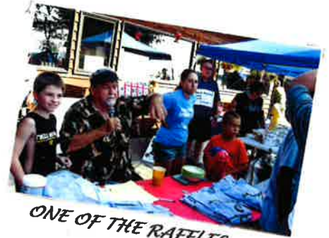
ONE OF THE RAFFLES