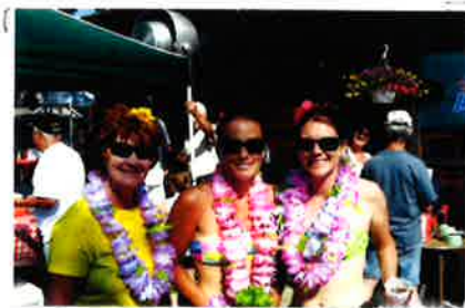
BOAT PARADE WINNERS