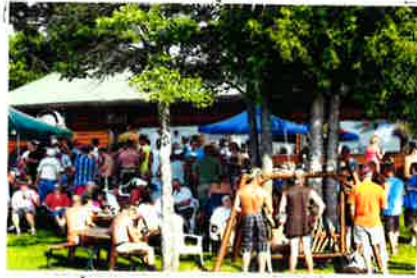
ENJOYING THE PICNIC