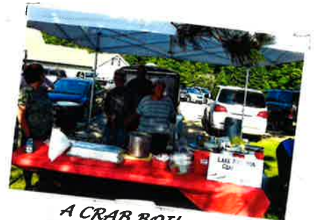
A CRAB BOIL