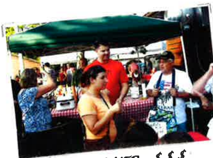
I'M A WINNER - $$$