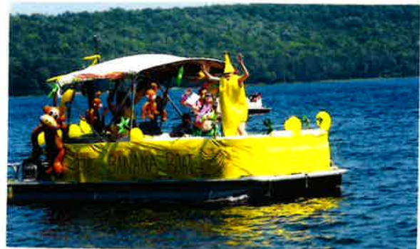
Third place was awarded to the Keith Stamper crew for "Banana Boat". This bright yellow decorated boat included a top banana and monkeys who cherish this fruit.