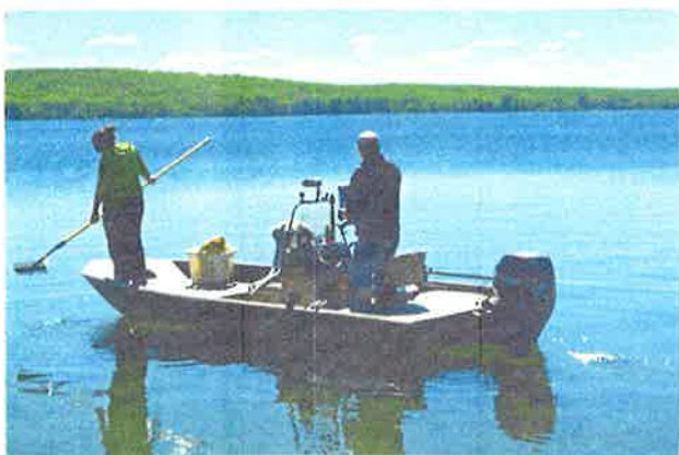
EWM SURVEY TEAM

On June 3, 2013 a pre-treatment survey of the aquatic EWM infestation was conducted by Onterra, LLC, Lake Metonga Association's consultant. Conditions were excellent for the survey. There was full sun and relatively light wind. The 2012 fall survey established EWM bed locations, GPS coordinates and total acreage. This pre-treatment survey verifies if there is any change in the beds mapped last fall. An underwater video camera is used to identify and mark the bed perimeters and GPS coordinates are updated based upon observed changes. The pre-treatment survey identified specific changes, increasing the final treatment strategy from 59.8 acres to 60.9 acres.