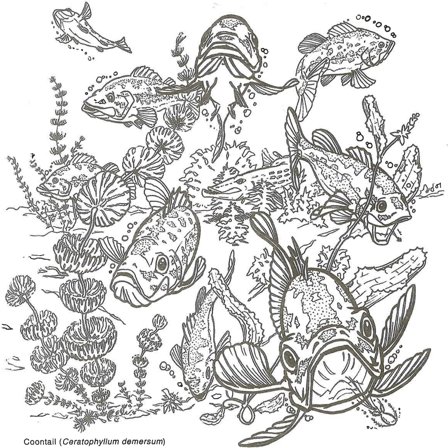
Coontail ( Ceratophyllum demersum )

All young bass, like kids, can be found in a "school".