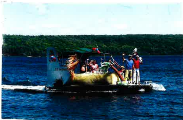
Ron Wolf's Crew – Gilligan's Island SS Minnow

participants from circling Lake Metonga at 2:00 p.m. on July 5 th . All the designs were exceptional. The judges selected the following top three.