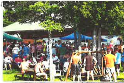
ENJOYING THE PICNIC