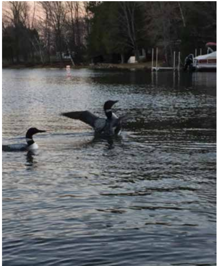
Loons returned to Farmer's Bay on April 13 just after the ice was out. "Come on in, dear, the water's fine!"

Days after putting the nest in, the loon pair started to sit on the nest and customize it to their nesting needs. This past fall, all of the chicks were able to fledge (grow wings big enough for flight), which is really exciting! As the weather got colder, I counted a total of 16 loons on Lake Metonga. This is because all loons north of Crandon start to migrate south and take a rest on the lake.