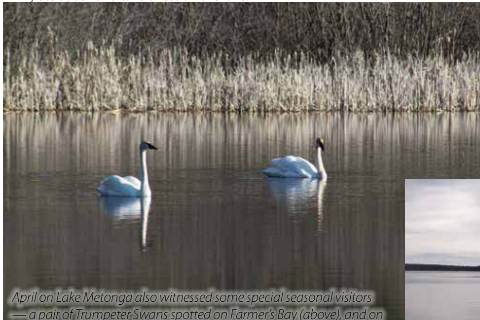
April on Lake Metonga also witnessed some special seasonal visitors — a pair of Trumpeter Swans spotted on Farmer's Bay (above), and on Peterson Bay (right). Trumpeters are the largest bird in North America. Once considered destined for extinction in the 1930s with fewer than 70 known birds, their numbers have increased to over 46,000 as of 2010*.