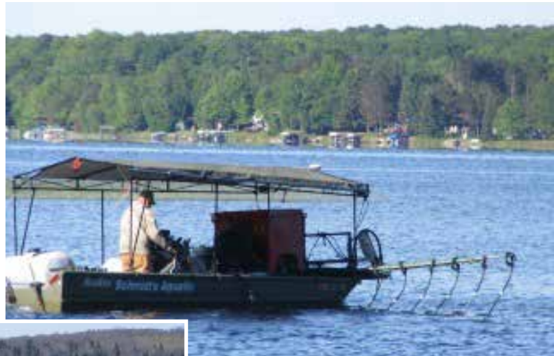
(Above) Late spring Euroasian water milfoil treatment by Schmidt Aquatic covered and 48 acres adjacent to the north and south boat launches and swimming areas.