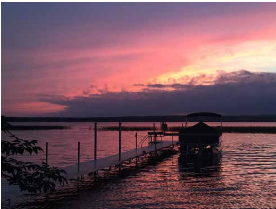
End of July sunset over the Truymen dock.