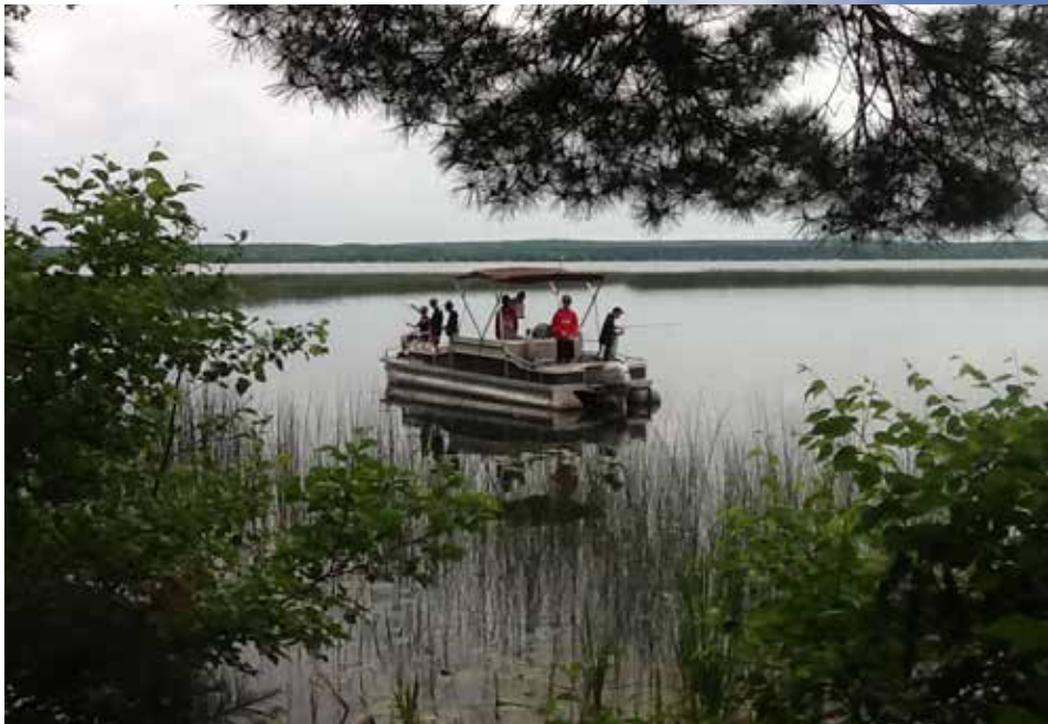
Fishing in Peterson Bay (prior to being overrun by milfoil).