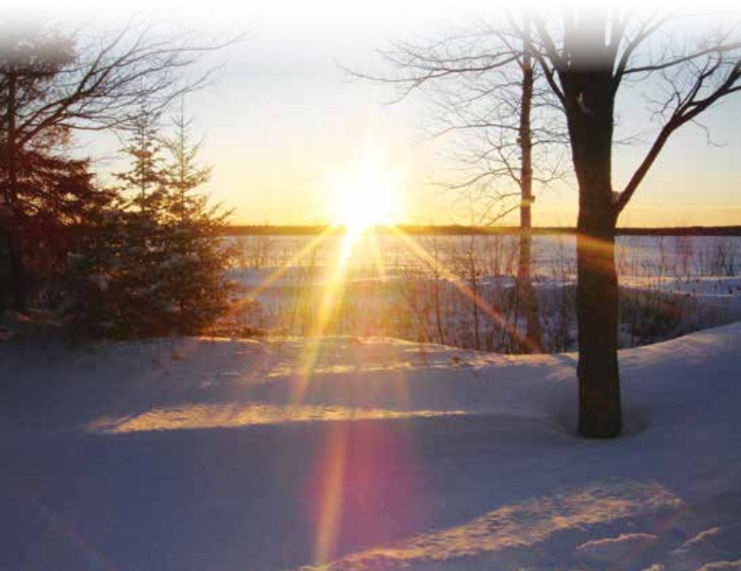
Sunset over the lake at about 5:30 pm. The days are starting to get longer — a sign that spring will be on its way soon.