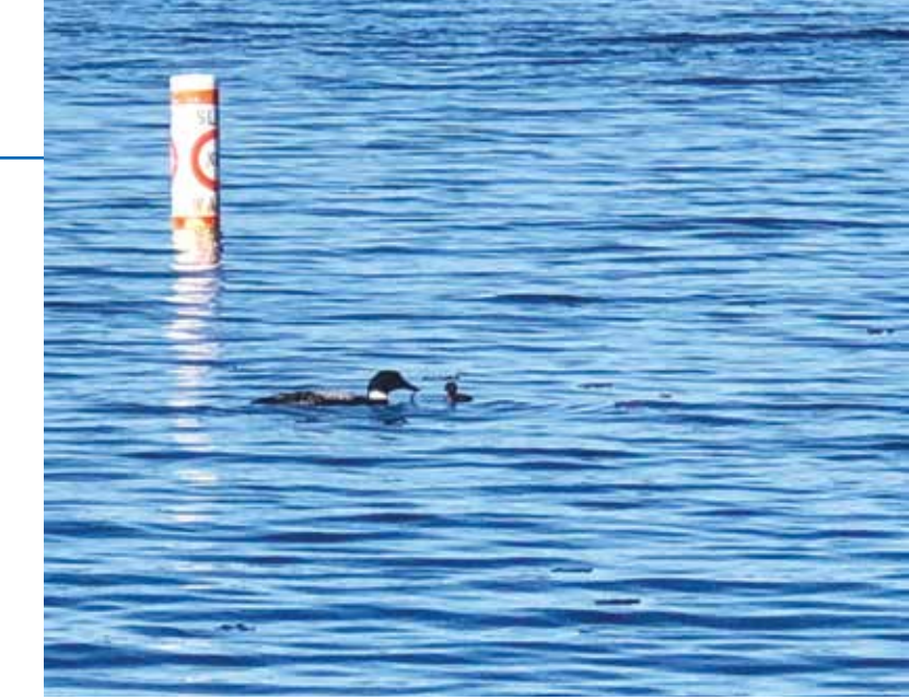
Adult and baby loon in Farmers Bay, Summer 2022

This year, the loon pair in Farmers Bay had to defend their nest and area with several floater loons and was more protective. In late May, a loner loon attempted to enter, and after several chest bumps from the nesting pair, the loner decided to leave. A couple weeks later, a mallard family got a little too close to the nest, and caused a bit of a stir with the loons defending their area and the ducks moved to another area in the lagoon. A short time later, the pair did a great job at defending the nest with an eagle fishing near the point. And again, in late June, four floater loons attempted to take over the territory. After a display of dominance, these floaters left the bay about ten minutes later, without harming the nesting pair or chick.