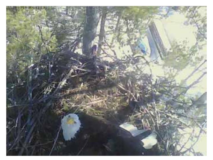
"What are you looking at?" Mom setting up nest mid-March.

Please continue to visit the website to view the eagles that are still visiting the nest and for real time lake condition views at Charlie's and North Beach.