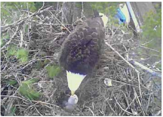
Mom with the one hatchling third week of April.