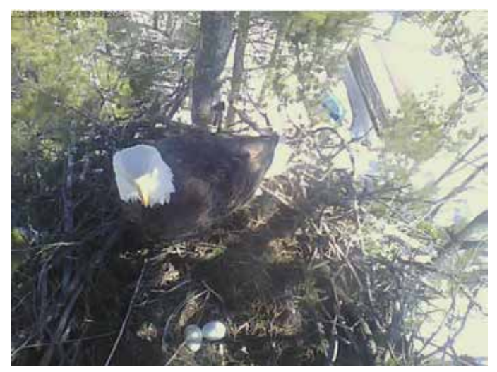
Toward the end of the March, two eggs are spotted in the nest during a quick incubation break time..