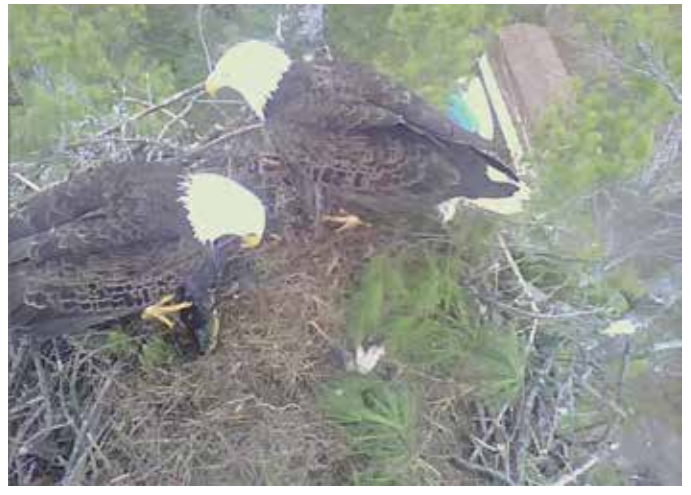
Life goes on. Empty nest parents console themselves with a perch.