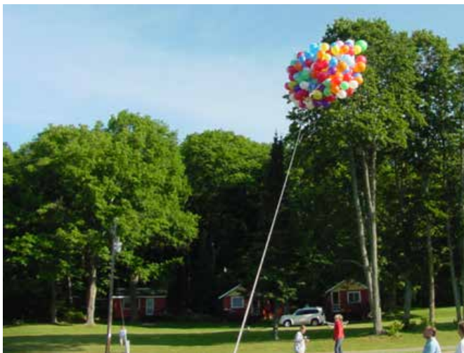
My first "drone" was simply a 35mm camera strapped to helium balloons in order to take this image over Lake Lucerne