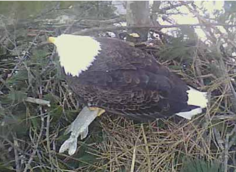
(Left) Tasty shore lunch. Not from Schaefer's; maybe pilfered from an ice fisherman's catch?

A pair of eagles have been frequenting the Eagle Tree nest early this year. Since the weather has warmed some, the nest is seeing considerably more activity. But, there's still no way of knowing if they'll be nesting this year. Let's hope so! Only time will tell.