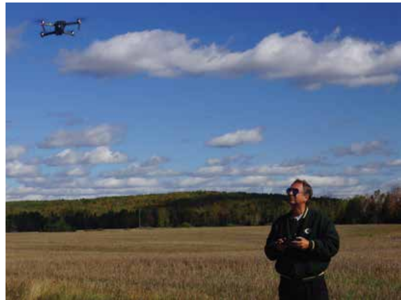
My new remote control drone.