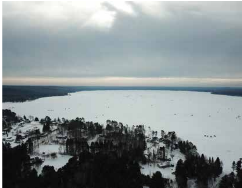
View of Lake Metonga ice fishing, late January 2018.

It has a very sophisticated collision avoidance system that uses 5 cameras, dual-band satellite positioning (GPS and GLONASS), 2 ultrasonic range finders, redundant sensors and a group of 24 powerful, specialized on-board computing cores. And just in case if things go bad, it has a handy "Return to Home" function.