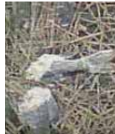
Photos from Lake Metonga website eagle cam