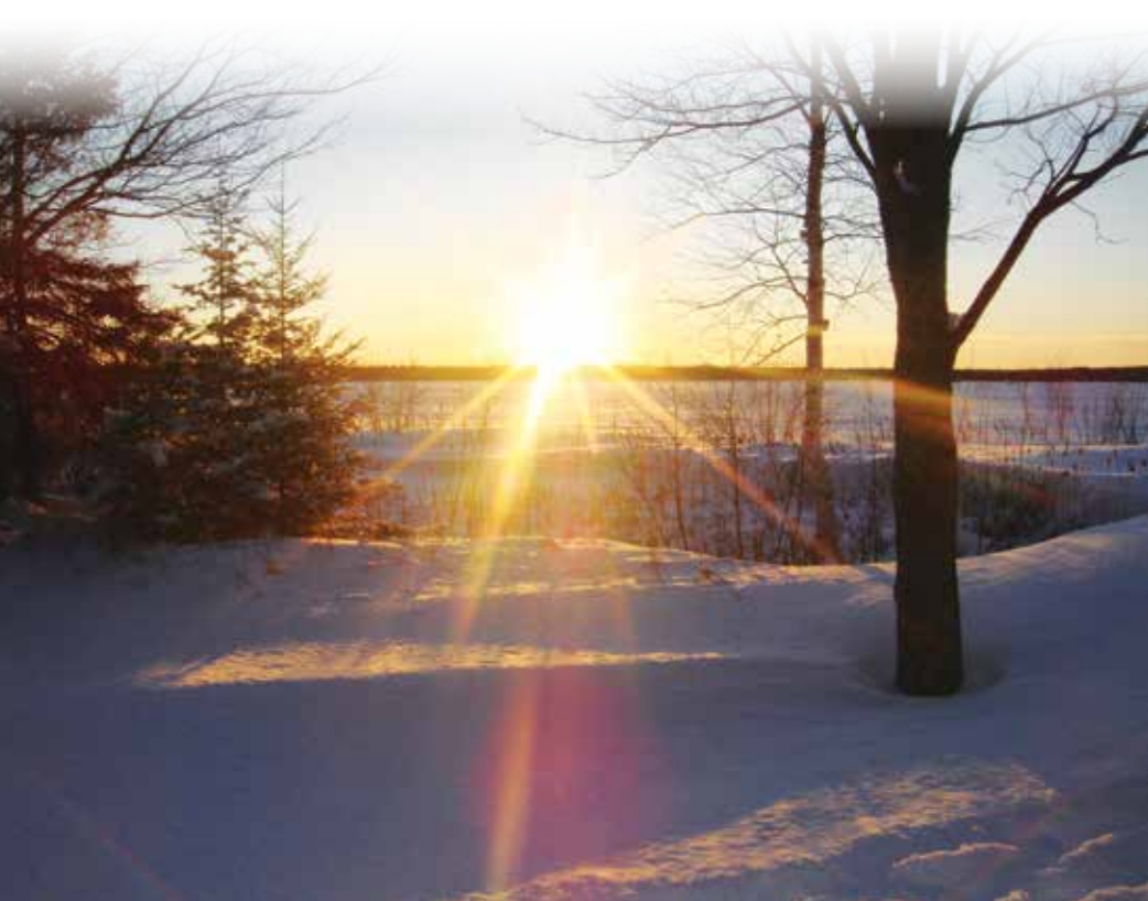
Sunset over the lake at about 5:30 pm. The days are starting to get longer — a sign that spring will be on its way soon.