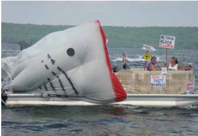
3rd Prize: Shark! Metonga Beach Closed...