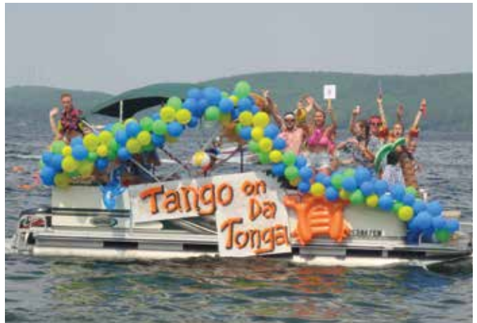
4th Prize: Tango on da Tonga