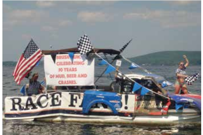
2nd Prize: Brush Run: 50 Years of Mud, Beer & Crashes