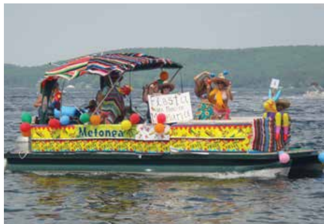
5th Prize: Fiesta like there's no mañana