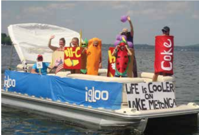
1st Prize: Life is Cooler on Lake Metonga