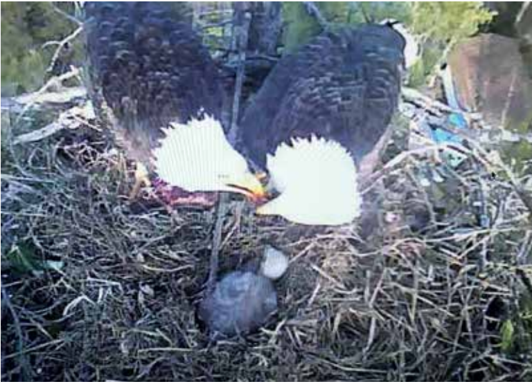
Left: The hand-off taking turns feeding junior.