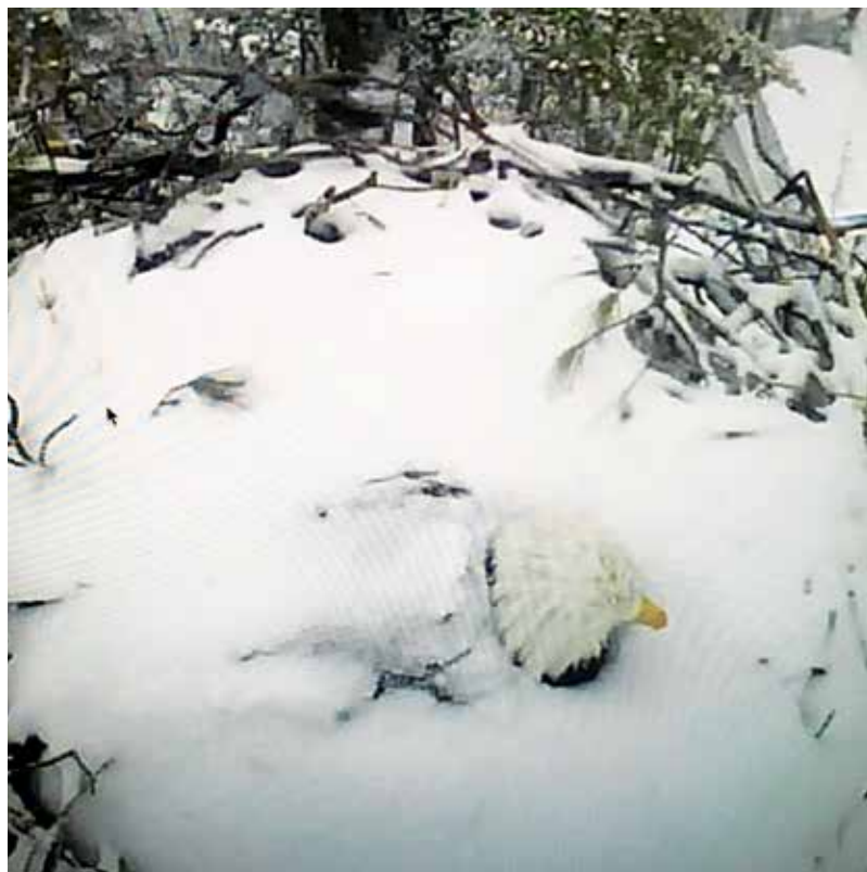
Above: A true example of real dedication, thick or thin.

You can catch all the action at our website homepage www.lakemetongawi.org , scroll down and click on "Truymans Eagle Tree Live Cam".