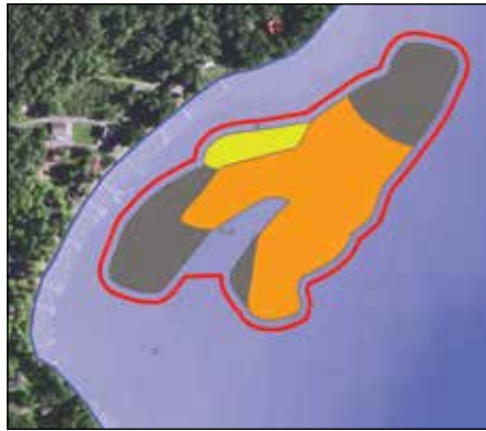
(Above Left) The 2021 late-fall mapping of the lake showed serious milfoil infestation in Strawberry Bay — scattered plant areas (gray), dominant groups (yellow) and highly dominant (orange). With DNR approval, the area was treated in the spring of this year.

Our annual lake-wide EWM mapping survey during September of 2021 (pretreatment), and September 2022 (post treatment), support these findings as shown in the maps below.