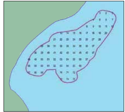
(Above Right) As follow-up, the treatment zone is mapped for sampling in mid-September. Milfoil was detected at only one of the 75 target points.

As the maps indicate, during the 2021 pretreatment EWM mapping survey, a highly dominant EWM colony was mapped in Strawberry Bay. During the 2022 post treatment mapping survey, no EWM was detected in this area.