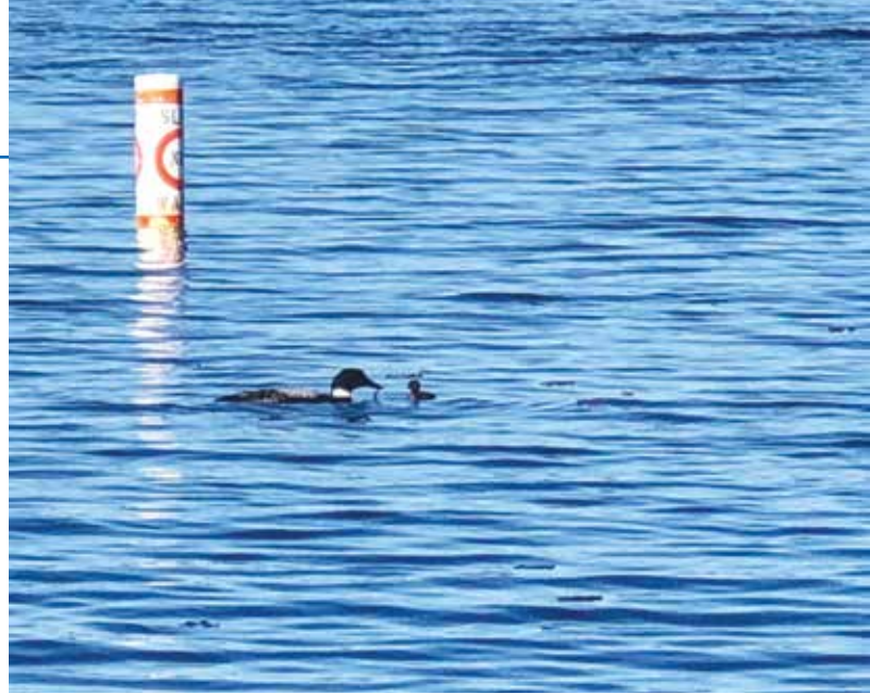
Adult and baby loon in Farmers Bay, Summer 2022

This year, the loon pair in Farmers Bay had to defend their nest and area with several floater loons and was more protective. In late May, a loner loon attempted to enter, and after several chest bumps from the nesting pair, the loner decided to leave. A couple weeks later, a mallard family got a little too close to the nest, and caused a bit of a stir with the loons defending their area and the ducks moved to another area in the lagoon. A short time later, the pair did a great job at defending the nest with an eagle fishing near the point. And again, in late June, four floater loons attempted to take over the territory. After a display of dominance, these floaters left the bay about ten minutes later, without harming the nesting pair or chick.