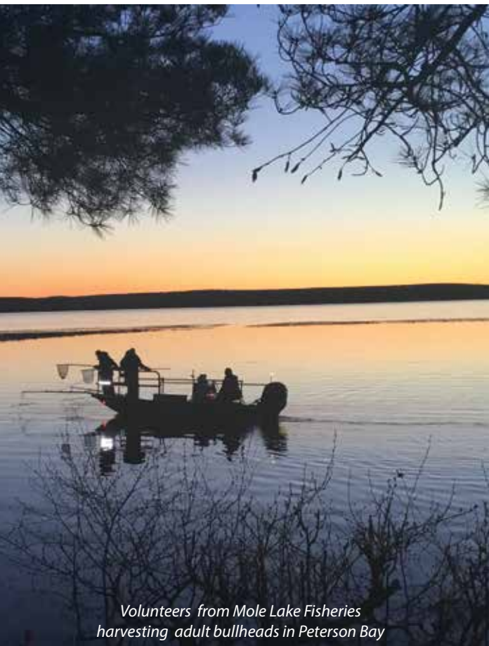
Volunteers from Mole Lake Fisheries harvesting adult bullheads in Peterson Bay