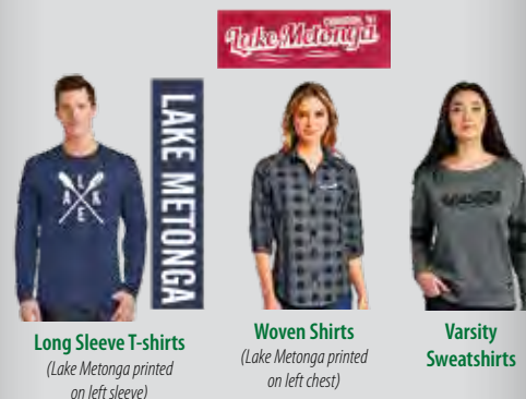
Long Sleeve T-shirts (Lake Metonga printed on left sleeve)