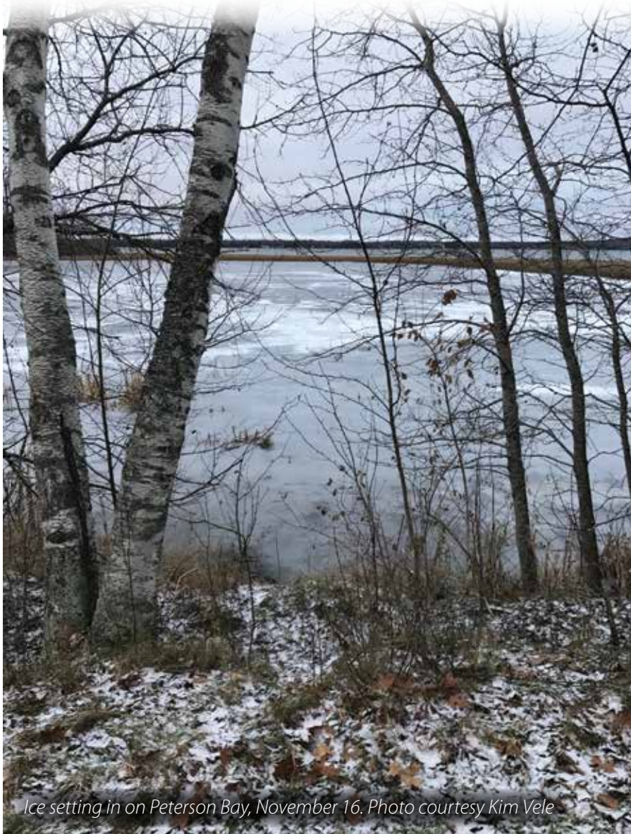
Ice setting in on Peterson Bay, November 16.