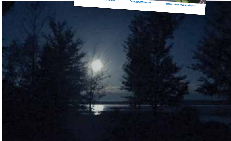
Full moon over Metonga, October 5.